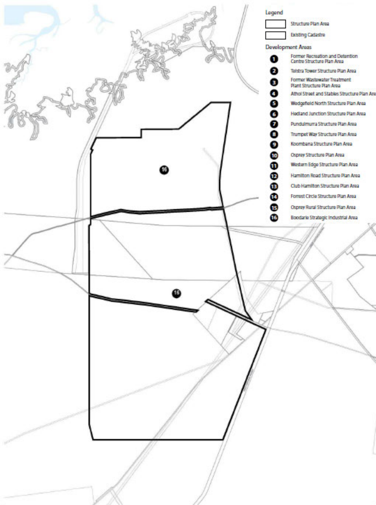
Schedule 2 - Structure Plan Areas