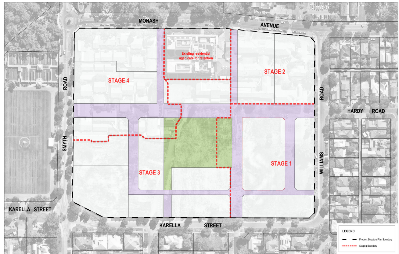
Figure 2: Indicative Staging Plan