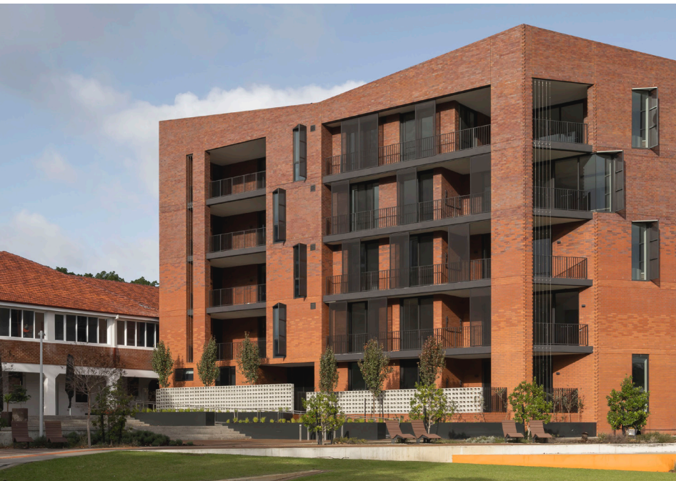
Victoria House by Human Urban

The purpose of this PSP is to co-ordinate the future zoning, subdivision and development of the PSP area. Its objectives, in the context of the design elements in State Planning Policy No. 7.2: Precinct Design, are as follows.