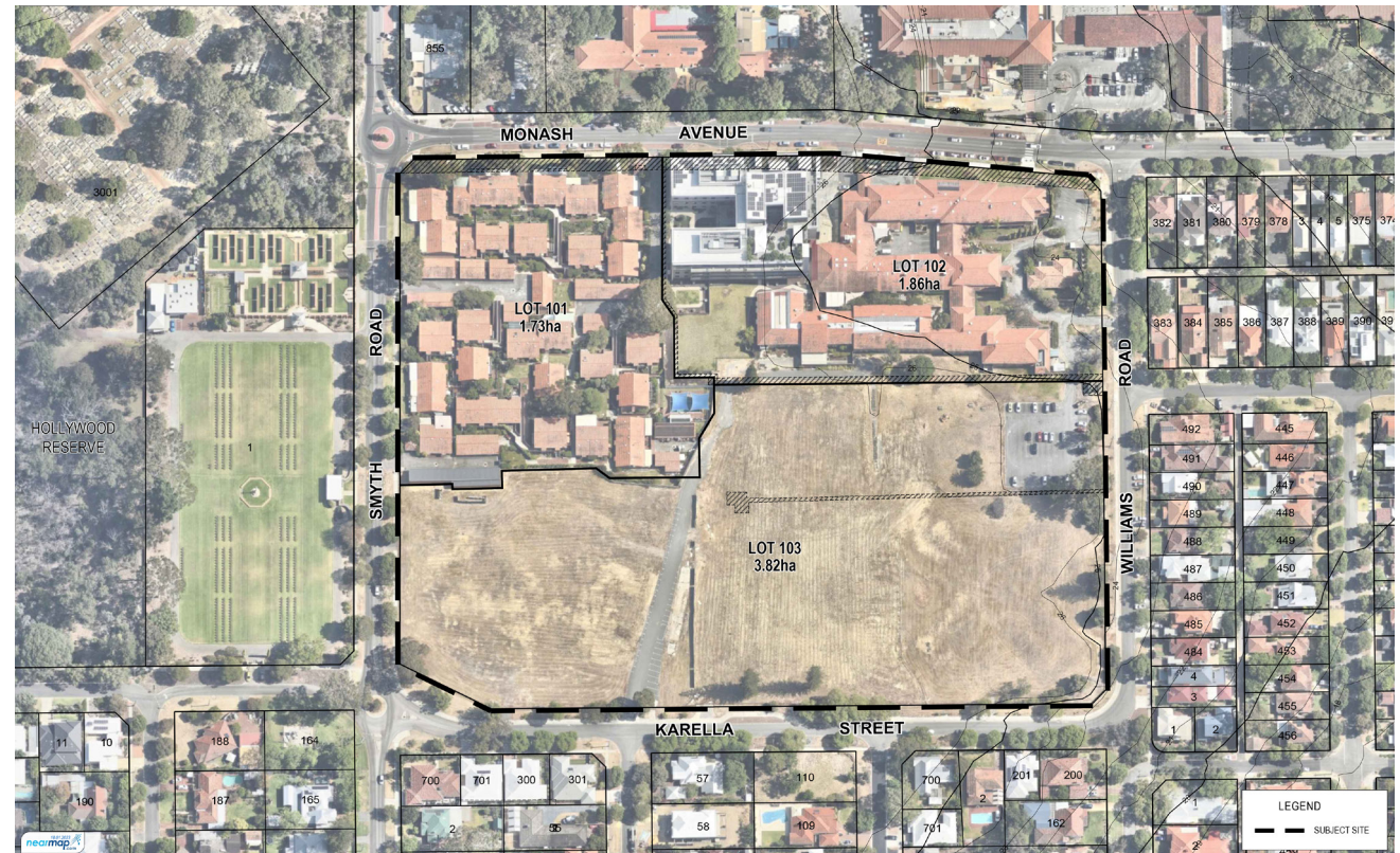
Figure 1: Site Plan

This PSP is in effect from the day it is approved by the WAPC, the date of which is stated on the Approval Page. As stated in Section 28 of the Deemed Provisions in the Planning and Development (Local Planning Schemes) Regulations 2015 , this PSP has effect for a period of 10 years from the day it comes into effect.