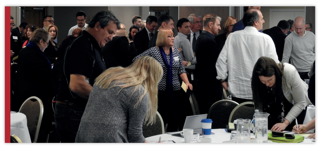
Perth Consultations, 18 August 2017

Additionally, government project requirements for apprentices/trainees could be strengthened by mandating specific ratios and ensuring rigorous compliance to verify employers are employing apprentices and trainees. Under the Government's Plan for Jobs, the Department of Training and Workforce Development's Priority Start policy is currently being expanded and will have stronger compliance requirements.