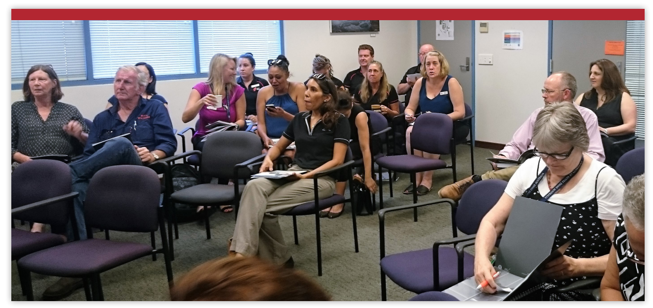
Broome consultations, 13 November 2017