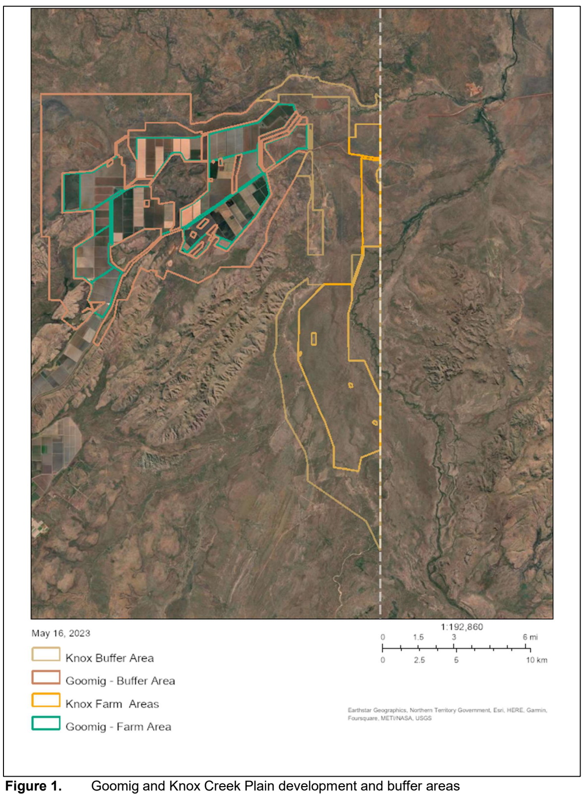
Goomig and Knox Creek Plain development and buffer areas