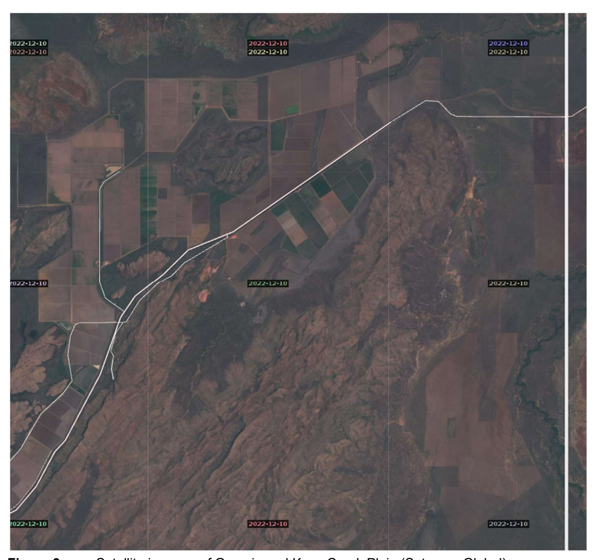
Figure 3. Satellite imagery of Goomig and Knox Creek Plain