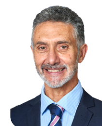
Hon Dr Tony Buti BPE, DipEd, MIR, LLB DPhil MLA Minister for Aboriginal Affairs