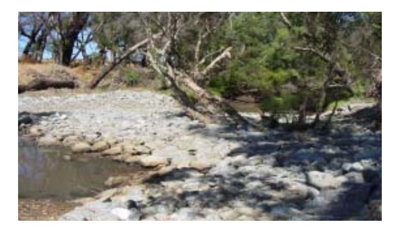
Plate 2: Placement of rocks within river.