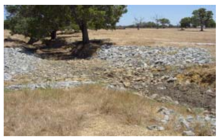
Plate 1: Placement of rocks in the drain.

With shire engineering expertise, local landholders knowledge, previous community river care projects experience (Serpentine River Group and the Dirk Brook Project Group) plus the facilitation by NHT funded officers, the project was planned, coordinated and completed in January 2003. Plates 1 and 2 show the placement of rocks in the drain and the river, respectively, in January 2003.