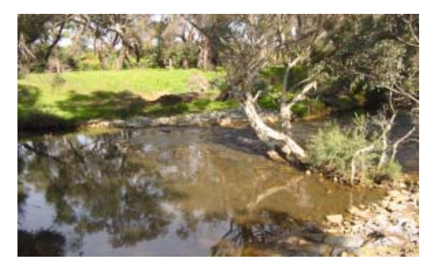
Plate 4: Shows the river site in August 2003.