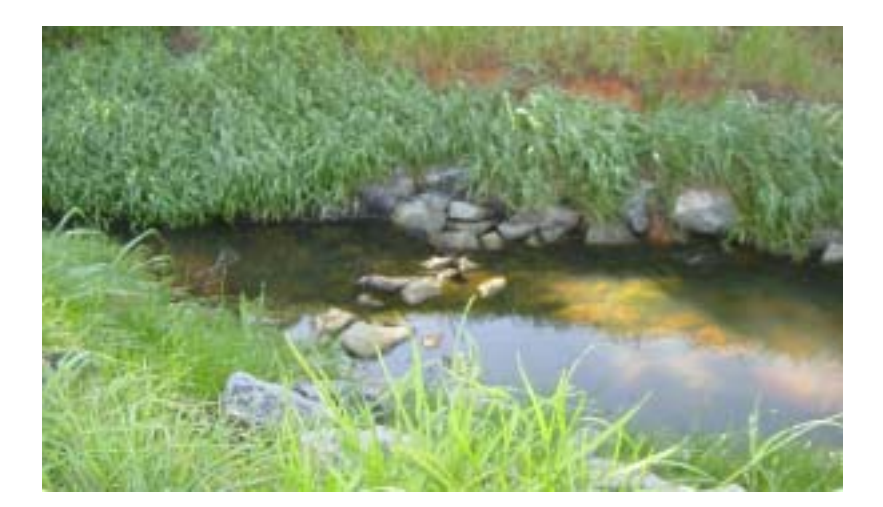
Plate 3: Shows the drain site in August 2003.