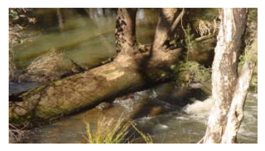
Plate 5: Tree fallen into the river creating a natural pool riffle system.