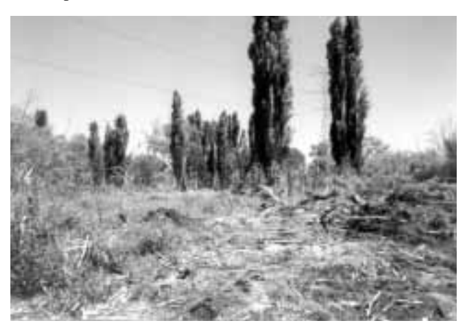
Chilean Willows have spread along Bennett Brook L. Taman in Caversham.

The use of large machinery to remove deciduous trees can result in damage to other flora and to the banks and floodplains of streams and rivers, and should be considered carefully. Mechanical removal is best for the smaller willows such as Chilean Willows, which are shallow-rooted and can be completely pulled out using a vehicle and chain. Care must be taken however to ensure that all broken branches are removed from the site before they take root and resprout.