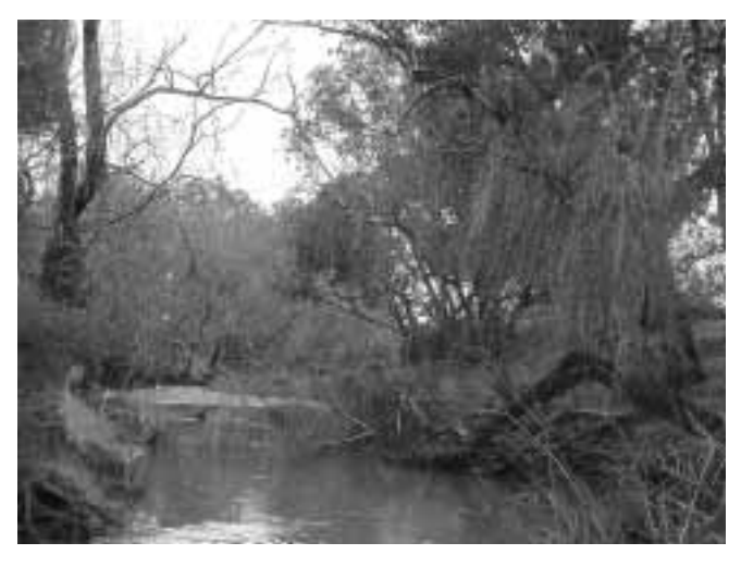
Weeping Willows along the Brunswick River. B. Hughes

The threat to water quality is much greater and more immediate. There is an increasing trend for landscapers of new housing estates to plant deciduous trees throughout the subdivision, leading to a large increase in organic matter entering drainage systems and waterways in late autumn/early winter.