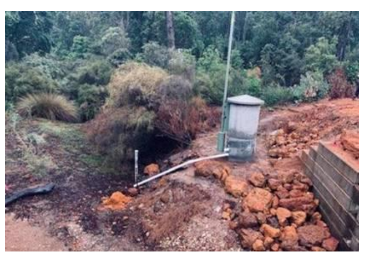
Above – Temporary floatwell installation completed 9 April 2020 at Manjimup Brook outflow

We are currently scheduling a two phase construction plan to provide us information on site specific power management and some contingency planning given the current COVID -19 situation which may disrupt the availability of staff or contractors.