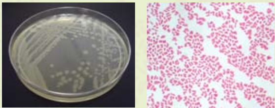
Escherichia coli on an agar plate and under the microscope

Pathogens are micro-organisms that cause illness in people and animals. Pathogens include bacteria ( Salmonella , Escherichia coli , Cholera ), protozoa ( Cryptosporidium , Giardia ), viruses ( Hepatitis ) and parasitic worms.