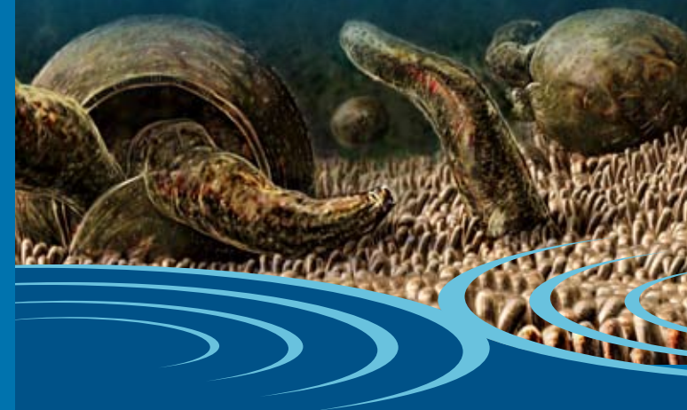
Cryptosporidium parvum under the microscope

‘The greatest risks to consumers from drinking water are pathogenic micro-organisms. Protection of water sources and treatment are of paramount importance and must never be compromised.’