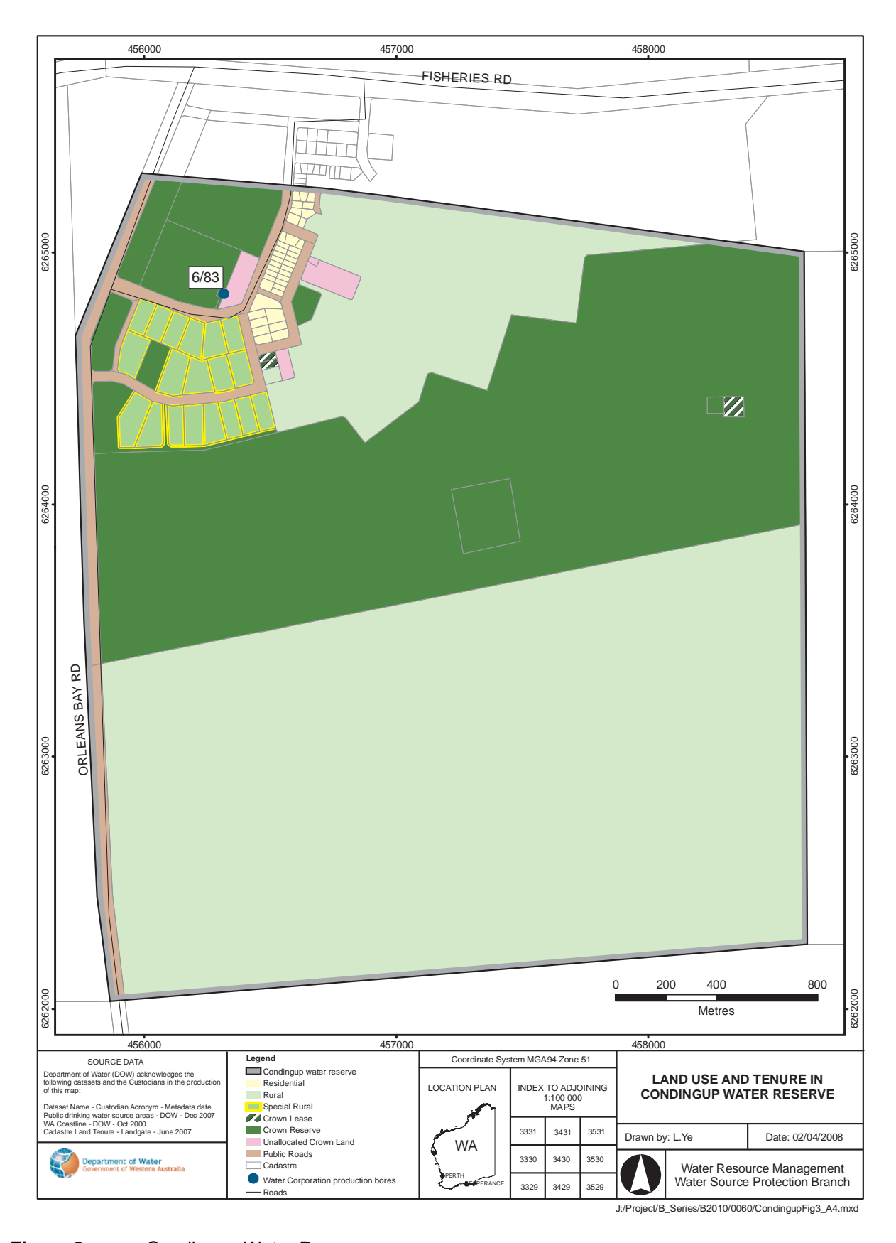
Figure 2 Condingup Water Reserve