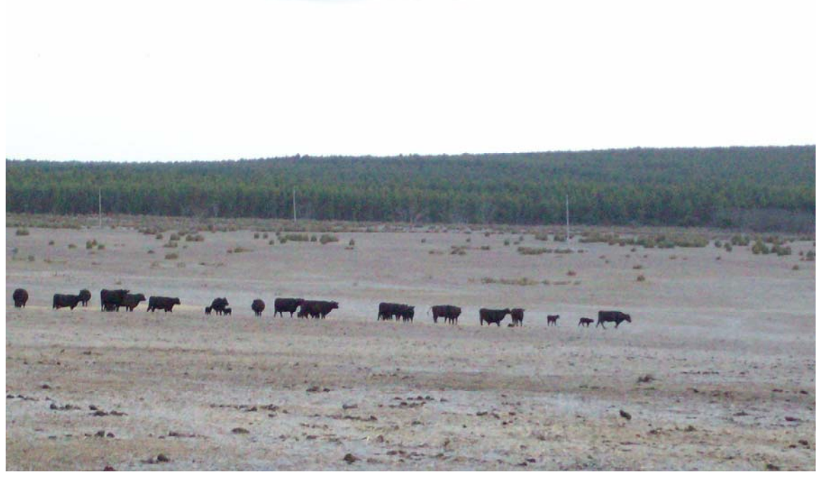
Photo 2 Typical broadacre agriculture activities in Condingup Water Reserve (note cattle grazing with plantation forestry (silviculture) in the background)