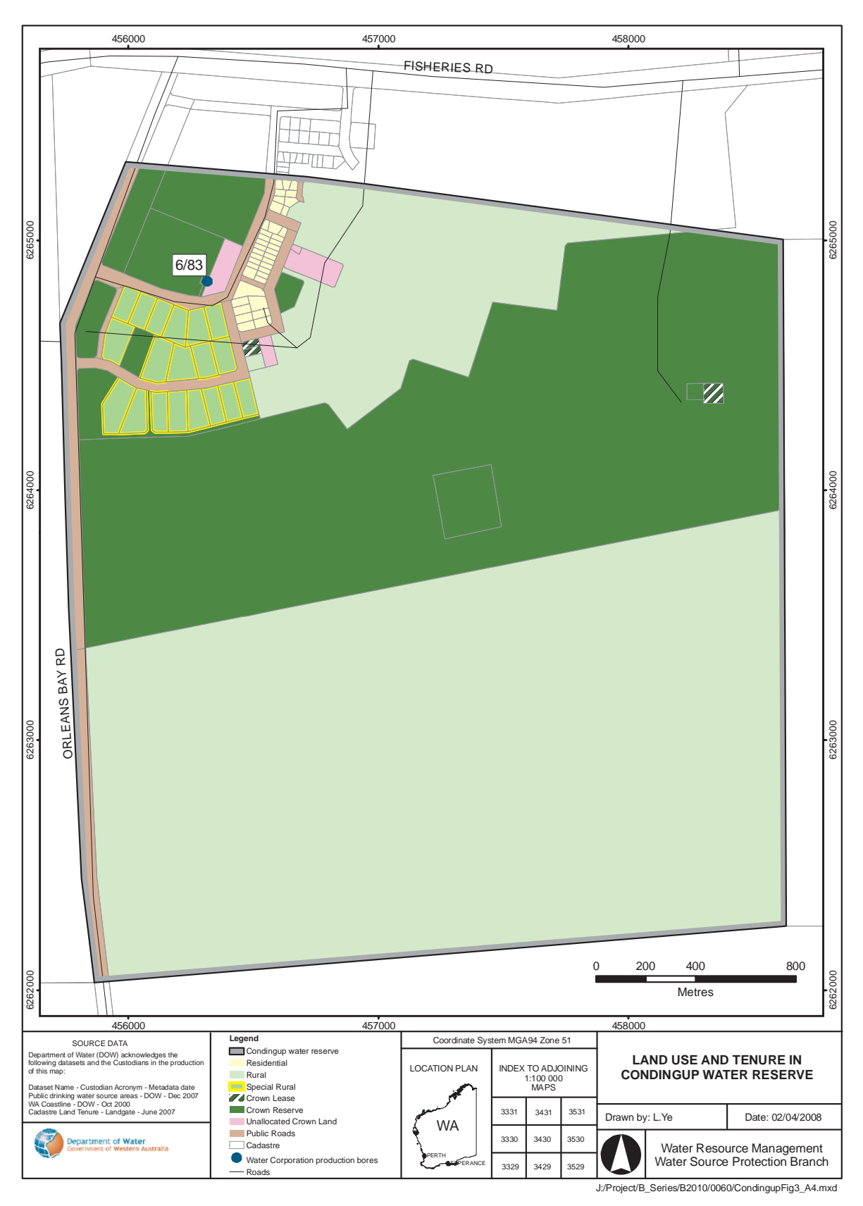
Figure 3 Land use and activities in the Condingup Water Reserve