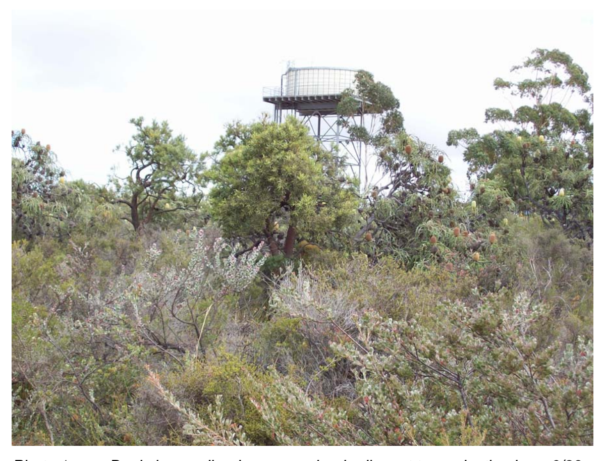
Photo 1 Banksia woodland on crown land adjacent to production bore 6/83 (note elevated water supply service tank in the background)