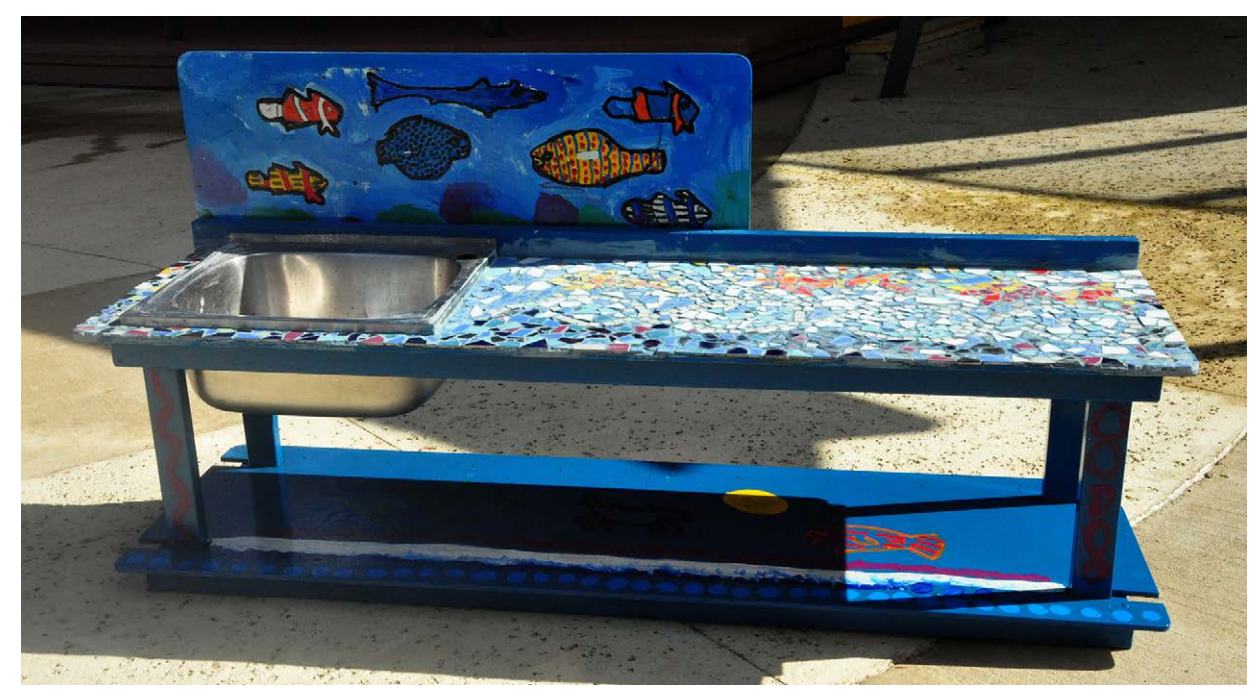
A sink made by residents of the Disability Justice Centre for a local high school.

On 22 November 2016 the then Director General of the DSC wrote to the Chief Advocate inviting the Chief Advocate to attend a meeting of the Community Engagement Group to provide the group with general information about the services provided by Advocates. The invitation was accepted and a PowerPoint presentation developed in early 2017 but the presentation did not proceed. The Chief Advocate remains willing to provide a presentation to the Community Engagement Group or any other community forum to provide information on the advocacy services for residents of the Disability Justice Centre.