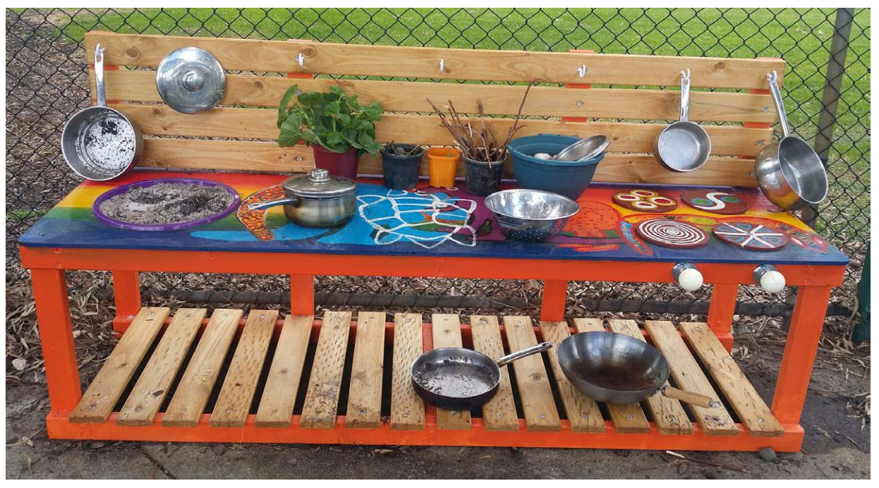
An example of a 'mud kitchen' made for local primary school and playgroup by residents of the Disability Justice Centre.

As an example of this and how residents can, and are, contributing to the local community, can be found in projects agreed by the Disability Justice Centre Community Engagement Group. Established in late 2016, the group aims to build and maintain linkages between the local community and the Disability Justice Centre. Projects undertaken to date by residents have included "mud kitchens" for a local primary school and local playgroup (as seen in photo) and a sink made for a local high school (as seen in photo). The residents were supported to utilise their woodwork skills to construct the mud kitchen before completing the artwork using designs and colours of their choice. This work is assisting the residents to gain vocational qualifications that will enable them to engage in meaningful work as part of their eventual return to living in the community. Residents have also made items for personal use such as garden boxes and benches for the veranda area outside of their