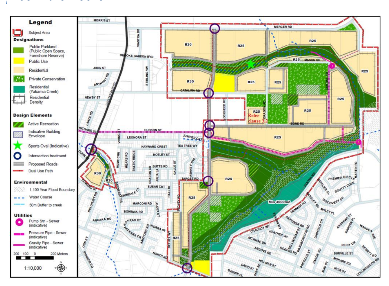
FIGURE 3. STRUCTURE PLAN MAP