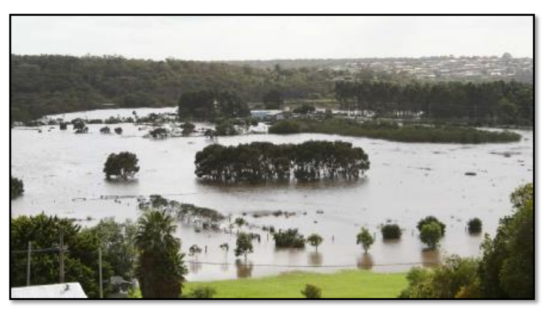
2005 - Flood/Yakamia Creek