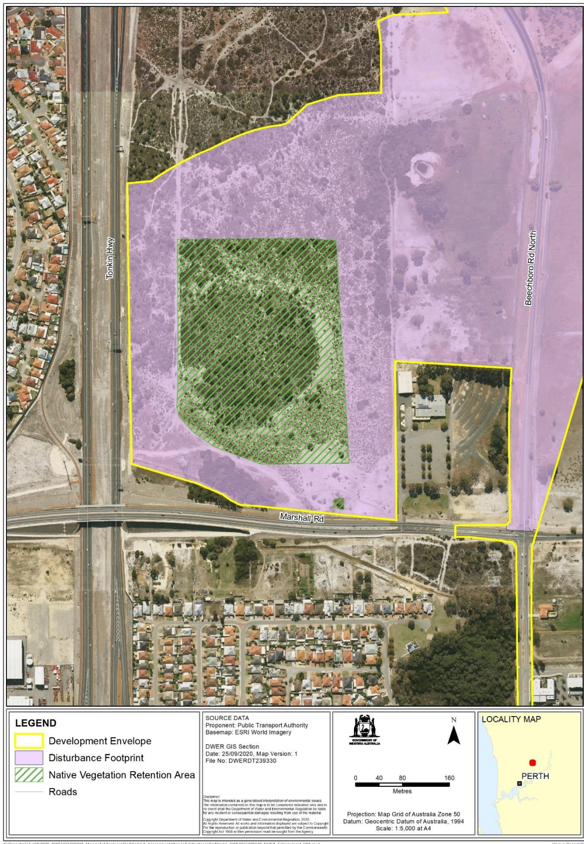
Figure 3: Native vegetation retention area at Patch 1 Malaga relevant to condition 8-1(9) and condition 8-2(3)