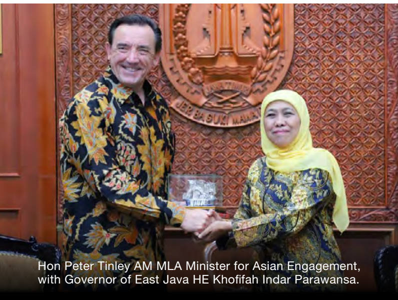
Hon Peter Tinley AM MLA Minister for Asian Engagement, with Governor of East Java HE Khoffah Indar Parawansa.

The department released Western Australia's first Asian Engagement Strategy in August 2019, recognising the growth of Asia and its immense economic, social and cultural opportunities. By 2050, Asia will represent over half of the global economy.