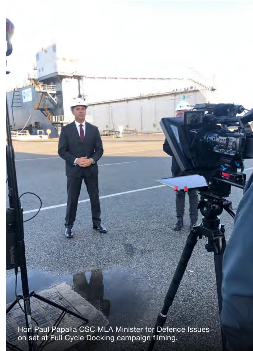
Hon Paul Papalia CSC MLA Minister for Defence Issues on set at Full Cycle Docking campaign filming.

The department created the Collins class submarine Full Cycle Docking media campaign for national and local awareness of the opportunities in the defence industry. This helped Western Australian companies become aware of the advantages of defence industry growth, showcase job opportunities and highlight government initiatives.