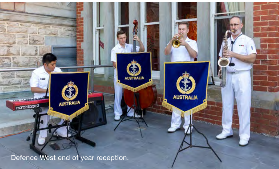
Defence West end of year reception.

The Defence Science Centre provides grants to support collaborative defence-relevant research and research-related