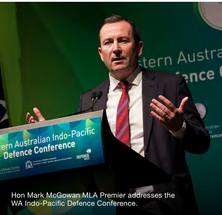
Hon Mark McGowan MLA Premier addresses the WA Indo-Pacific Defence Conference.

It was a great opportunity for the state's defence industry to showcase its capabilities to the world, ranging from