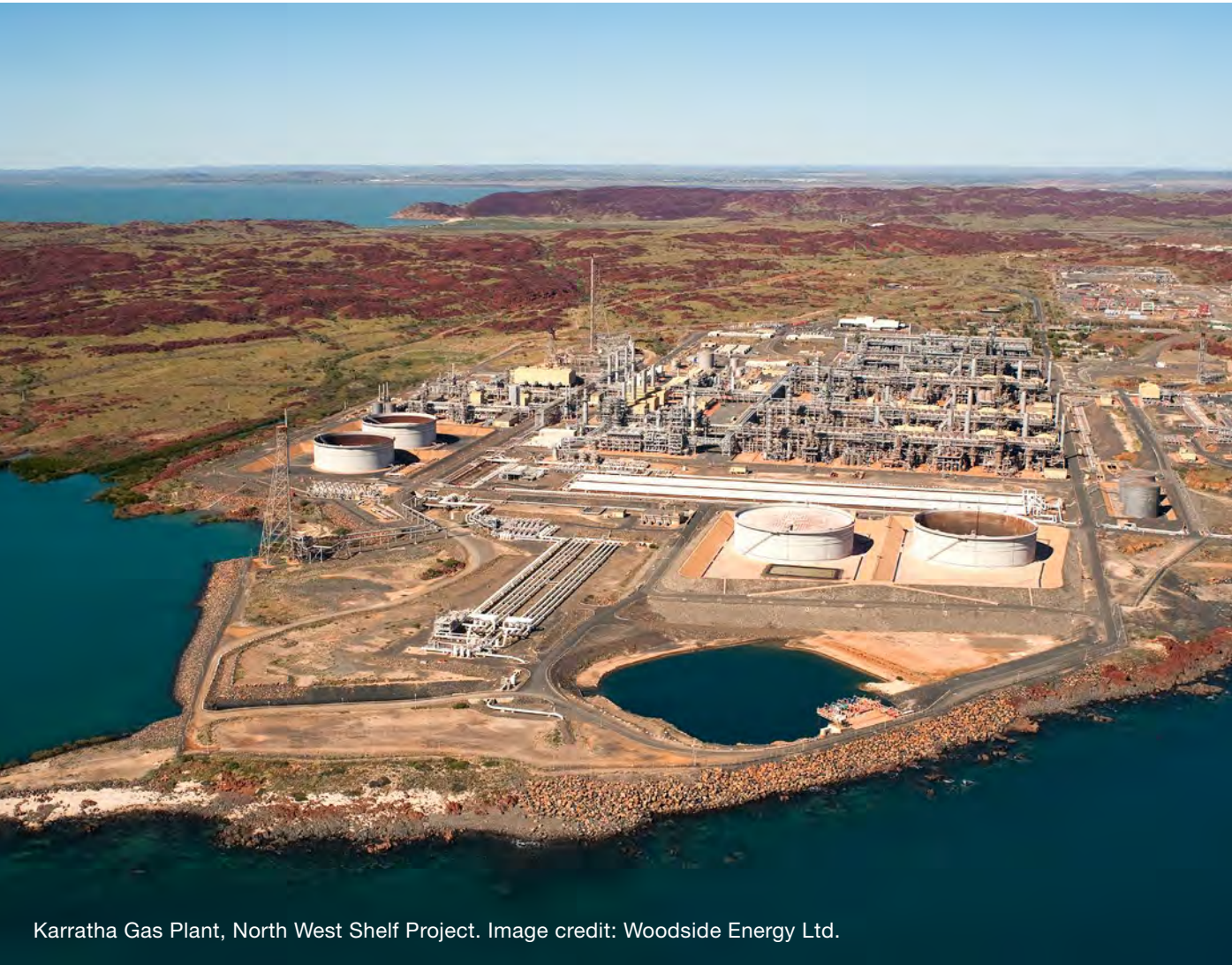
Karratha Gas Plant, North West Shelf Project.

provided by Premier Coal which documented its rehabilitation activities at Lake Kepwari over a 20-year period. It is expected that the process to surrender the lake from the mining lease will be completed in preparation for the opening to the public for recreational purposes in late 2020.