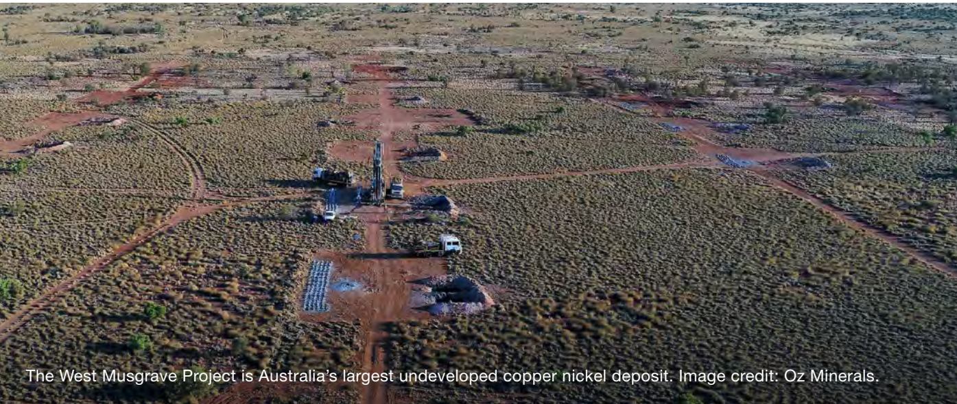
The West Musgrave Project is Australia's largest undeveloped copper nickel deposit.

The department is working with proponents in the critical minerals industry to understand project requirements and challenges.