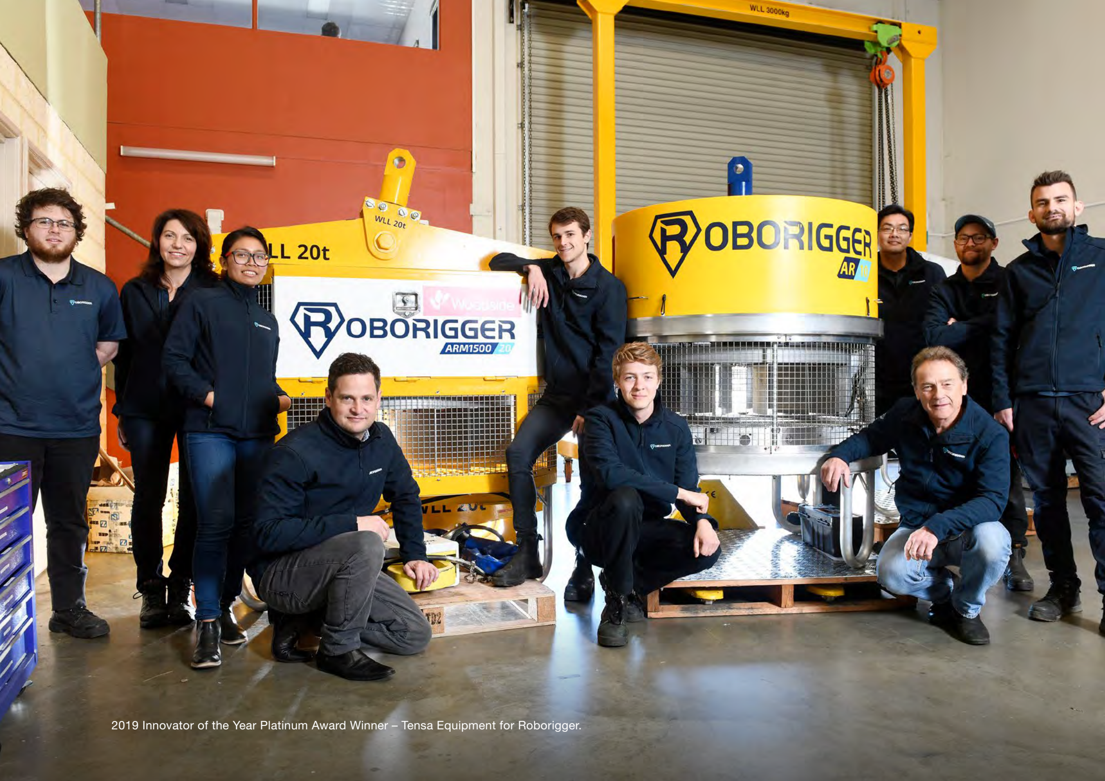
2019 Innovator of the Year Platinum Award Winner – Tensa Equipment for Roborigger.