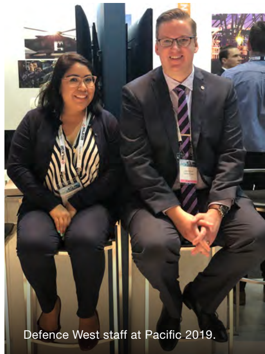
Defence West staff at Pacific 2019.