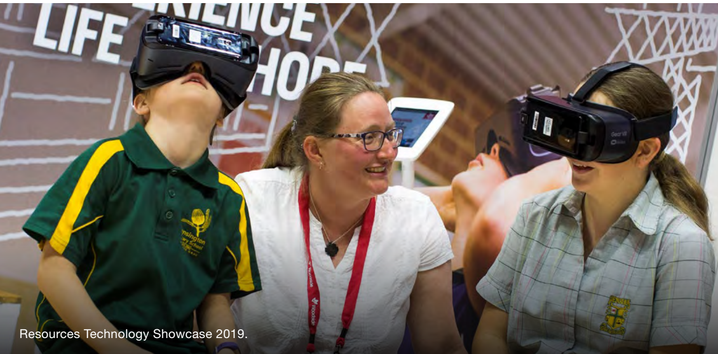
Resources Technology Showcase 2019.