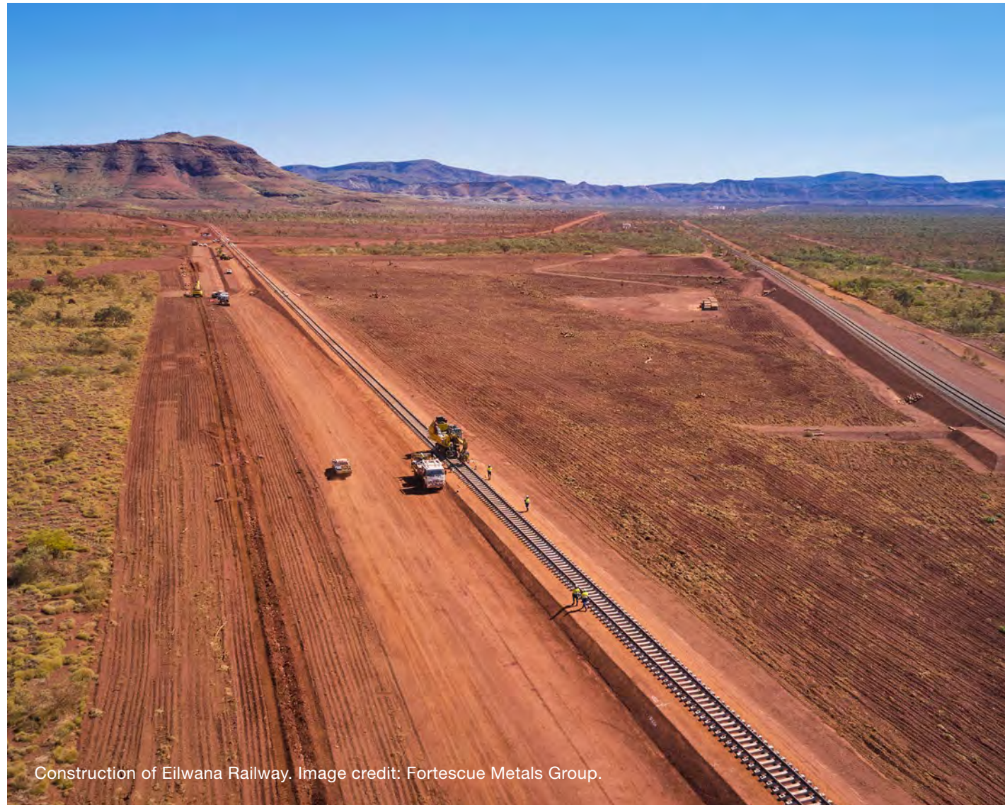
Construction of Eliwana Railway.

During 2019-20, the department coordinated the review by government agencies of the draft close-out report