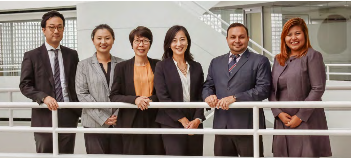
Western Australia's education business development managers from China, India, Indonesia, Japan, Singapore and South Korea in Perth for the Australian International Education Conference.