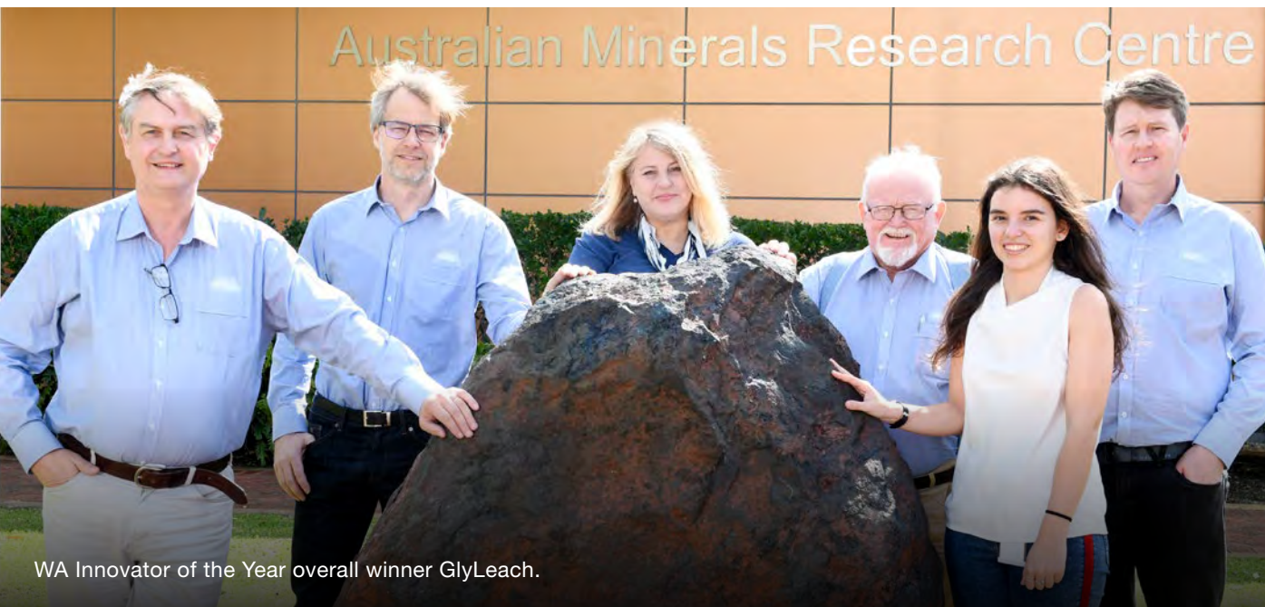
WA Innovator of the Year overall winner GlyLeach.

The WA AustCyber Innovation Hub, the WA Data Science Innovation Hub and the MTP Connect WA Life Sciences Innovation Hub delivered expert services, advice, mentoring and a range of targeted programs and initiatives to develop the state's capability and capacity for the current and future workforce. The hubs have invaluable local,