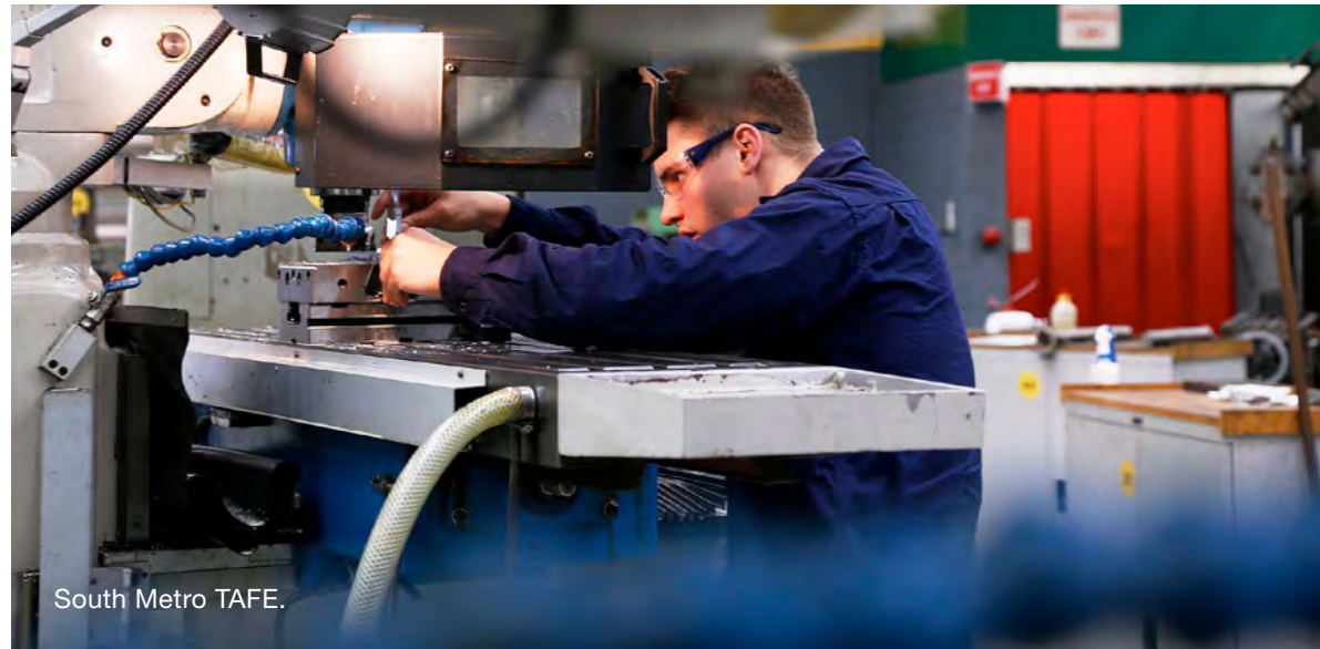
South Metro TAFE.

In 2019-20, the department administered 7 funding rounds – METRONET Railcar