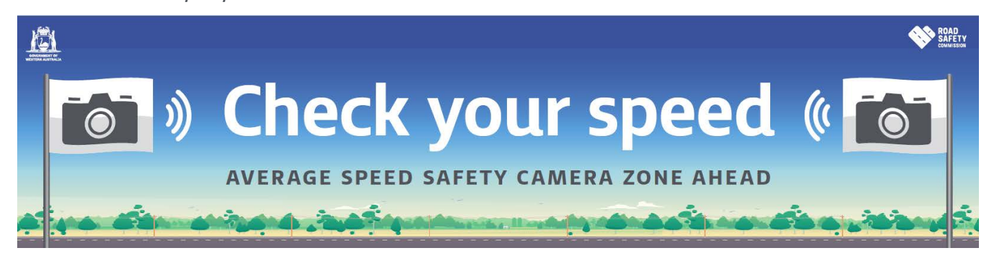
Average-speed Safety Cameras on Forrest Highway go live 6 September 2017 If you speed you will get caught