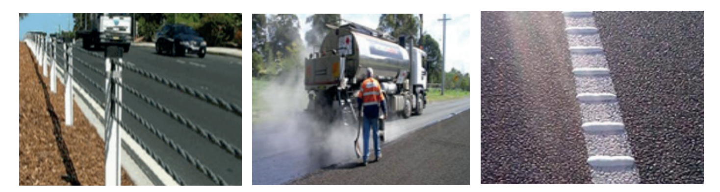
Flexible Wire Barrier