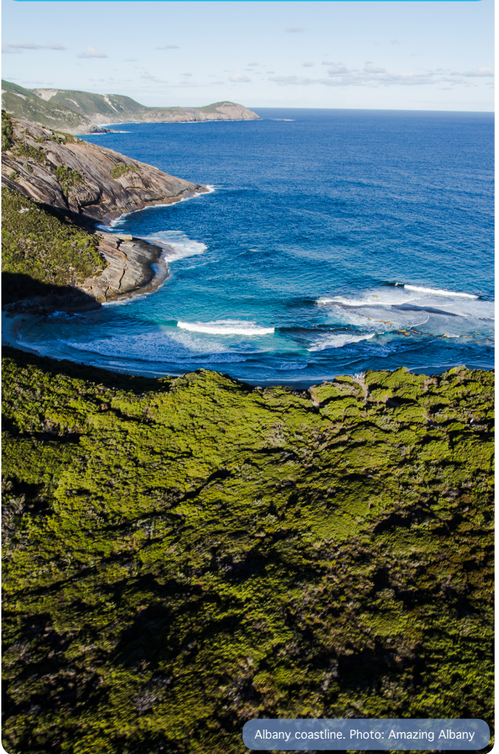
Albany coastline.

A sustainable coast for the long-term benefit of the community and visitors to the State