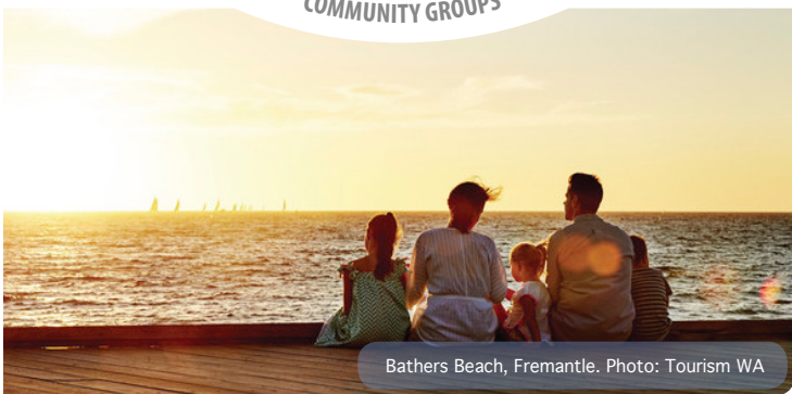
Bathers Beach, Fremantle.

To view the full WA Coastal Zone Strategy and for further information, please visit: www.dplh.wa.gov.au or contact coastwest@planning.wa.gov.au