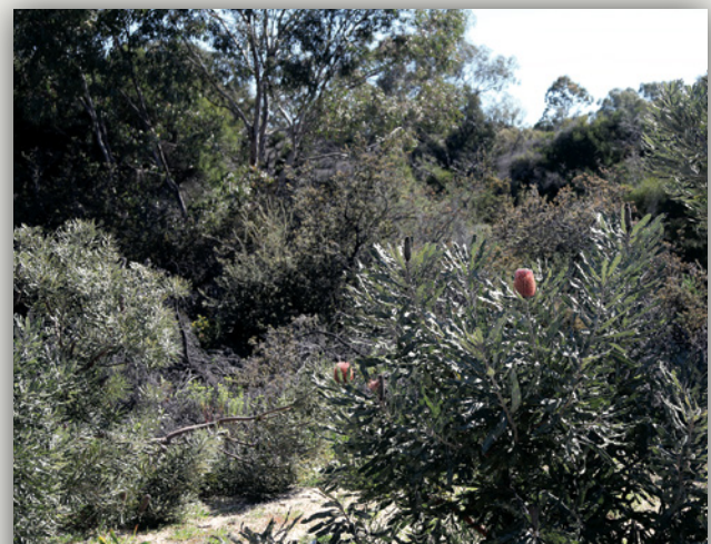
Figure 6.14: Quenda Wetland, Murdoch

An ecological linkages study should be undertaken as part of the next planning stage due to the compatible spatial associations and connection at the landscape scale.