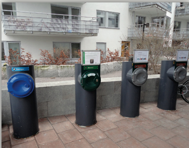
Figure 6.06: Vacuum waste and recycling system – Hammarby, Stockholm

The specialist activities and institutions make it problematic to develop and coordinate a waste management strategy across the centre, yet there is scope for the local and regional councils to prepare a code which could be applied at precinct level. For example, targets could be set for new commercial and residential developments, including trialling of pilot schemes within the urban core.