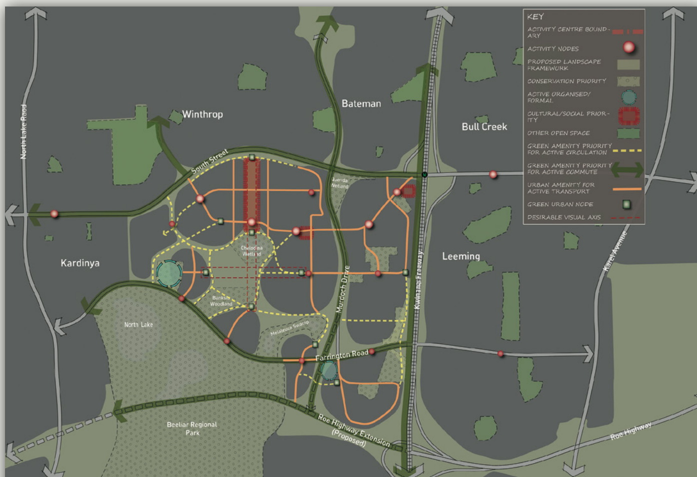
Figure 6.12: Strategic open space and circulation structure

The preparation of future local structure plans, masterplans or detailed area plans will need to ensure that the active transport is systematically integrated and continuous and is given priority over private vehicular transport. In addition to the active circulation demarcated in the plan there will be additional circulation for secondary level access, such as walking trails and footpaths for passive recreation. More detail on the overall movement strategy for the activity centre is previously set out in Chapter 4.