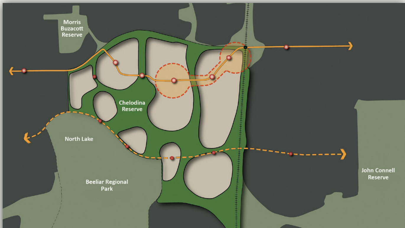
Figure 6.11: Murdoch landscape frame concept

In relation to designated conservation areas, the Department of Environment Regulation sets appropriate buffers around natural wetlands and guidelines for determining buffer requirements. Currently there is a 50 metre minimum standard but further analysis of the wetland characteristics within the study area is required to inform precinct development limitations. Generally, the preservation of remnant vegetation will add value and amenity to the area and its users/visitors in terms of recreation, educational pursuits and aesthetics. Conservation areas are shown in Figure 6.12 as part of the strategic landscape and open space structure.