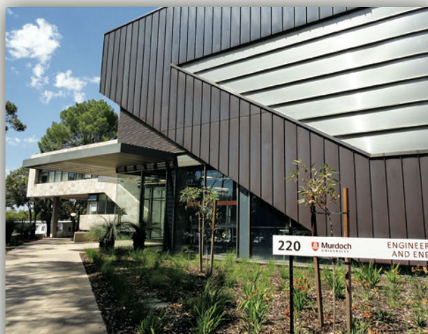
Figure 6.05: High quality building design at Murdoch University