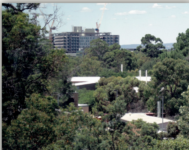
Figure 6.10: Fiona Stanley Hospital viewed from Murdoch University

The landscape strategy set out in this structure plan provides for protection and enhancement of wildlife habitat and corridors across the activity centre. The above actions are for relevant planning authorities and major stakeholders in the Murdoch area to consider implementing through their local policies, plans and systems.