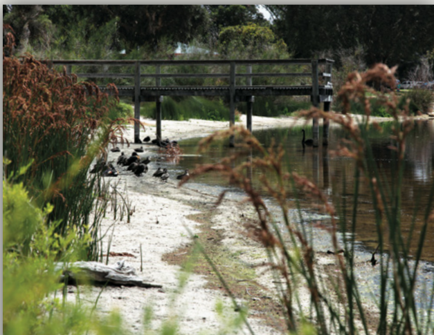
Figure 6.07: Bibra Lake wetland

Desalination plants may not be the complete answer to water shortages as the energy required to put water through the reverse osmosis process is excessive, along with the associated carbon dioxide emissions. The most significant benefits in terms of water savings, apart from the principle of reducing consumption habits, can therefore be achieved by capturing and recycling rainwater and grey water on-site and ultimately releasing it into the soft landscape and natural garden areas of the activity centre. This should mimic the native environment as much as possible.