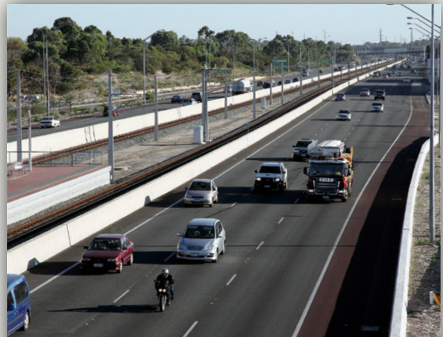
Figure 6.03: Traffic on Kwinana Freeway at Murdoch