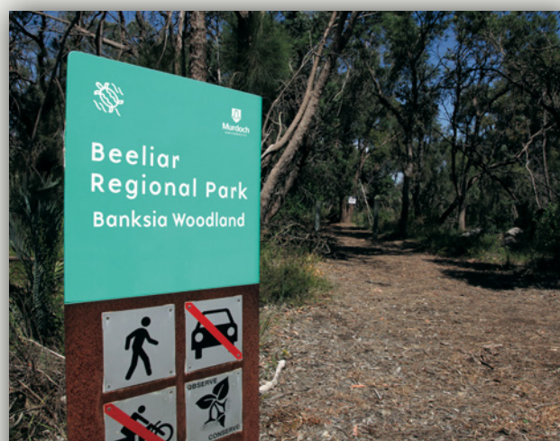
Figure 6.01: Gateway to Beeliar Regional Park

Recommendations about additional surveys of the natural environment to inform strategic planning and precinct level design are set out in Section 6.10.