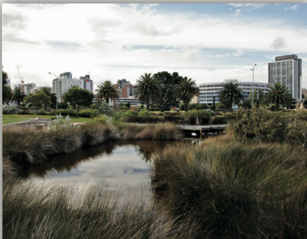
Figure 6.08: Point Fraser – water-sensitive urban design

In addition, investigations should be made with Water Corporation about the capacity of the wastewater network to serve further development at Murdoch. The underground sewer mains within the University grounds may require modification to support development within the southern and south-eastern part of the campus. However, opportunities to provide a long-term connected system across the activity centre should also be explored as part of the next stage of strategic planning for Murdoch.