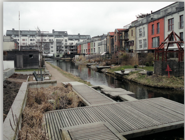
Figure 6.09: Sustainable urban drainage – Bo01, Malmö, Sweden