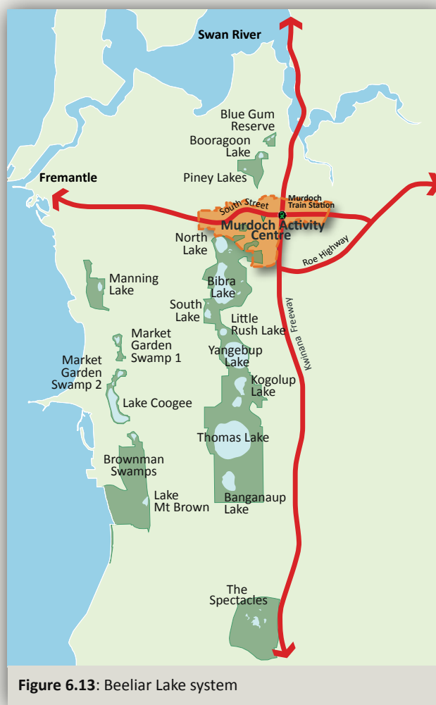
Figure 6.13: Beeliar Lake system

The structure plan has a key role to play in ensuring that these sites are appropriately protected or respected in the context of the proposed urban development structure. The landscape framework conceived for the study area provides for the full retention and conservation of formal wetland areas.