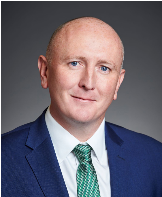
Hon Stephen Dawson MLC Minister for Disability Services

As the McGowan Government ramps up the level of our ambition, we want this ambition to be matched by the community and businesses and to follow the great examples being set by the disability sector. I encourage you to play your part in delivering the State Disability Strategy by committing to your own actions.