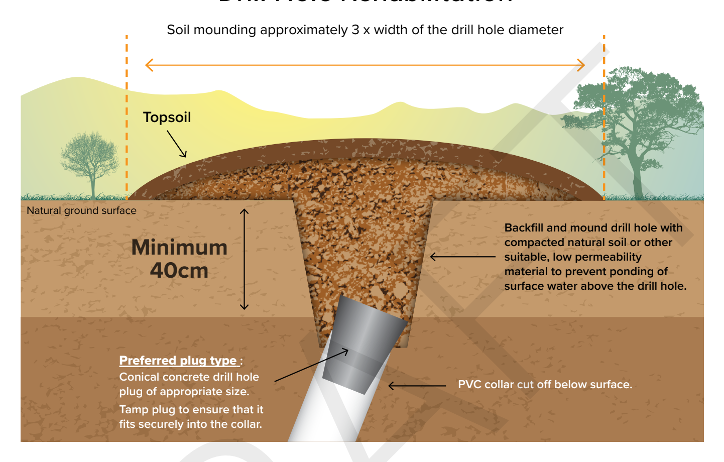
Figure 2: Rehabilitating a drill hole