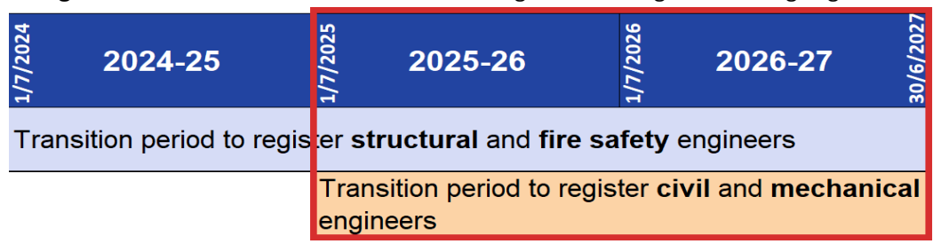
Figure 2: Commencement and transition arrangements to register building engineers

NB: the period outlined in red – 1 July 2025 to 30 June 2027 – is when people can apply to be registered in multiple areas across stages, for example structural and civil.