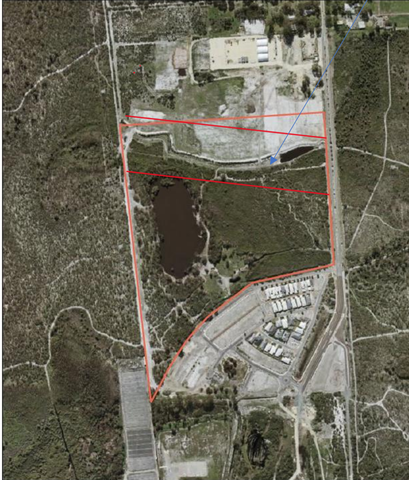
Lot 9005 Treeby Road, DMO12938

Previously excavated trench, now containing a volume of C & D Waste